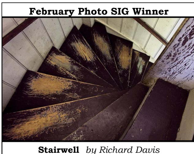
February Photo SIG Winner

They agreed to run again and will be hunting for mandatory re-pecements under the by-laws for next year's election. We have term-