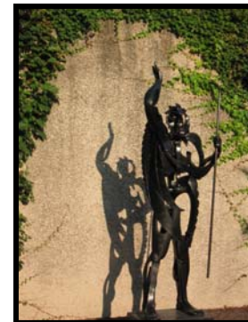
Shadows of the Past