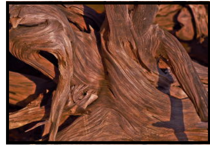
Texture of Driftwood