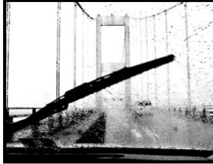
Rainy Day on the Bridge