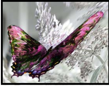
Butterfly in Distortion