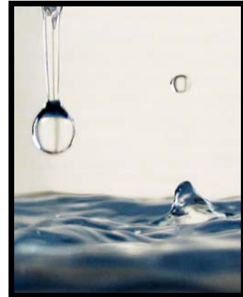
Filtered Water Drops