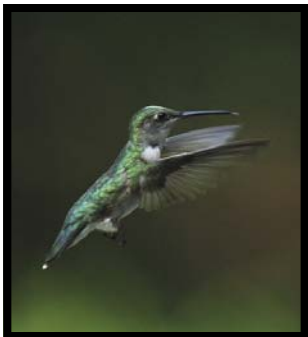
Hummingbird in Flight