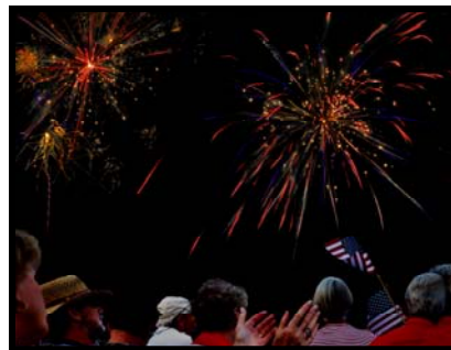
Fourth of July